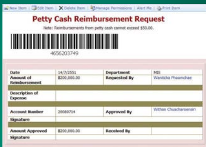
Create different view to support various groups of users