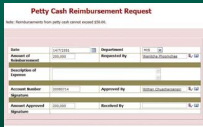
Change visual look of SharePoint List without breaking SharePoint code/architecture